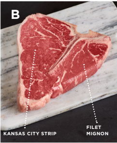
The Porterhouse Cut