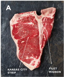
The T-Bone Cut